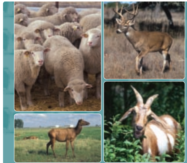
Animals affected by transmissible spongiform encephalopathies include cattle, sheep, deer, goats, and elk.

Following confirmation of a positive BSE diagnosis in Northern Alberta, Canada in May 2003, the